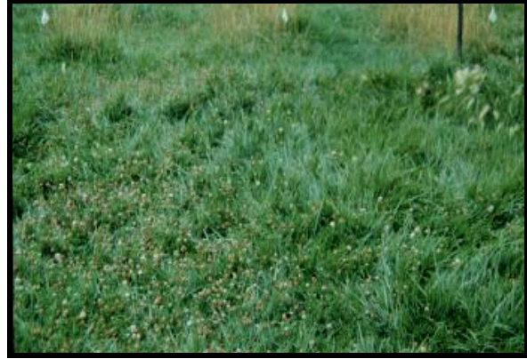
A mixed tall fescue-clover stand. Managing the stand with nitrogen or phosphorus can shift the balance to favor either the grass or legume.

but is frequently found on sandy soils, fields irrigated with clean waters low in potassium, and high elevation sites. Limited research has shown that grass and grass-legume mixtures respond to potassium when soils are deficient. Fertilizer should not be applied unless a soil test indicates a need since fertilizing high potassium soils will produce undesirably high potassium levels in the forage. Potassium recommendations based on current soil test results are summarized in Table 4.