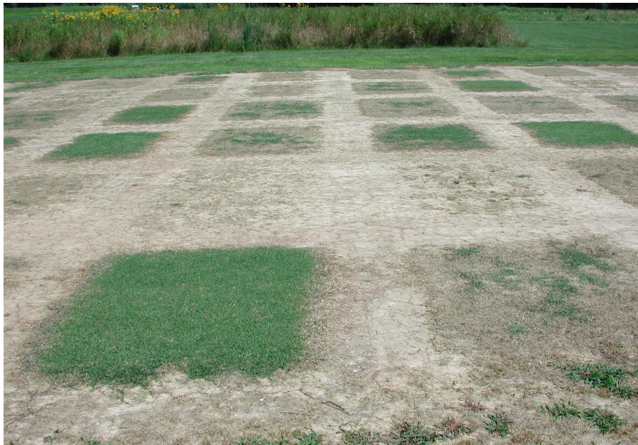
Winterkill differences among bermudagrass cultivars in Maryland