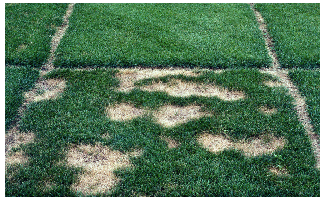
Summer Patch of Kentucky Bluegrass