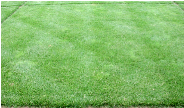
turf-type tall fescue